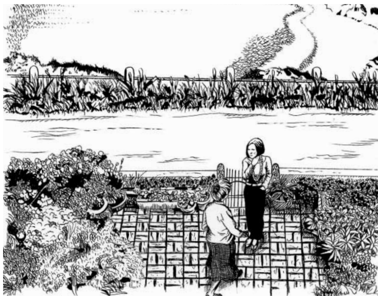
She saw the cliffs and the grey sea through the trees.

They went down the stairs, and their mother came into the cottage.